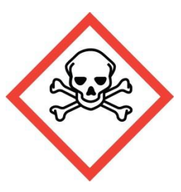
Section 3: Composition/Information on Ingredients